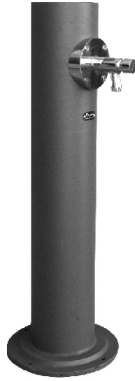
FU002 ; 002D

H: 1000 ; \varnothing 194 BASE: \varnothing 340