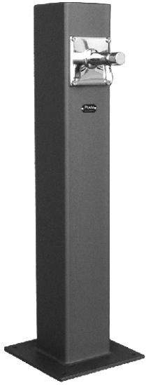
FU001 ; 001D

H: 1000 ; \varnothing 160 BASE: \varnothing 300